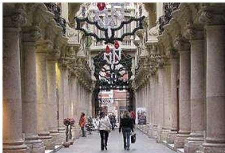
Walk around Paseo Lodaes